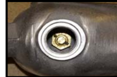
Internal oil flow adjuster