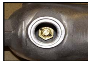
Internal oil flow adjuster (w manual relieving safety fill caps)