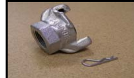
3/4 FNPT 2 lug fitting for 185's, 60 & 90 Lb breakers w safety pin.