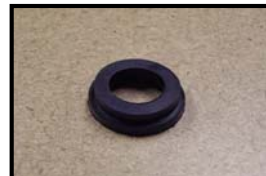
Gasket for 2 lug coupling.